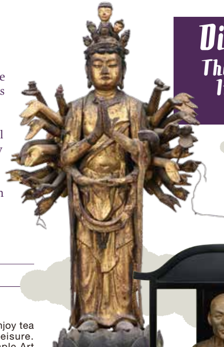
Thousand-Armed Kannon Statue (Sahasrabhuja Avalokitesvara): Chofukuji Temple