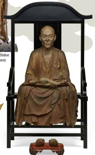
Wooden Monk Rankei Doryu Statue: Kenchoji Temple, important cultural property

Get reacquainted with monks Rankei Doryu and Shokoku Isen (Anrakuji Temple) for the first time in 770 years!